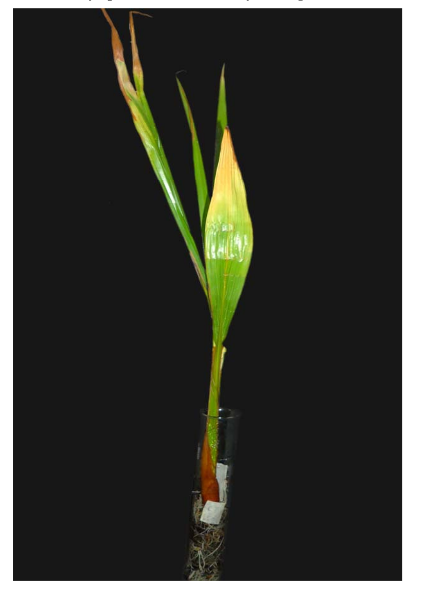
Figure 2. In vitro symptoms of water stress: yellowing and necrosis of leaves