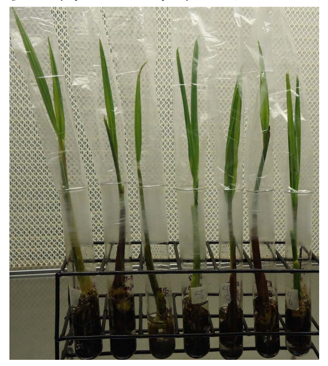
Figure 1. Embryos produced with the first photosynthetic leaf (Ran thembili varieties)