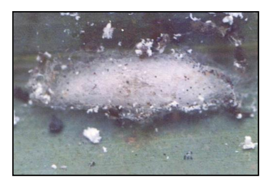
Figure 4. Adult of Dipha aphidivopra