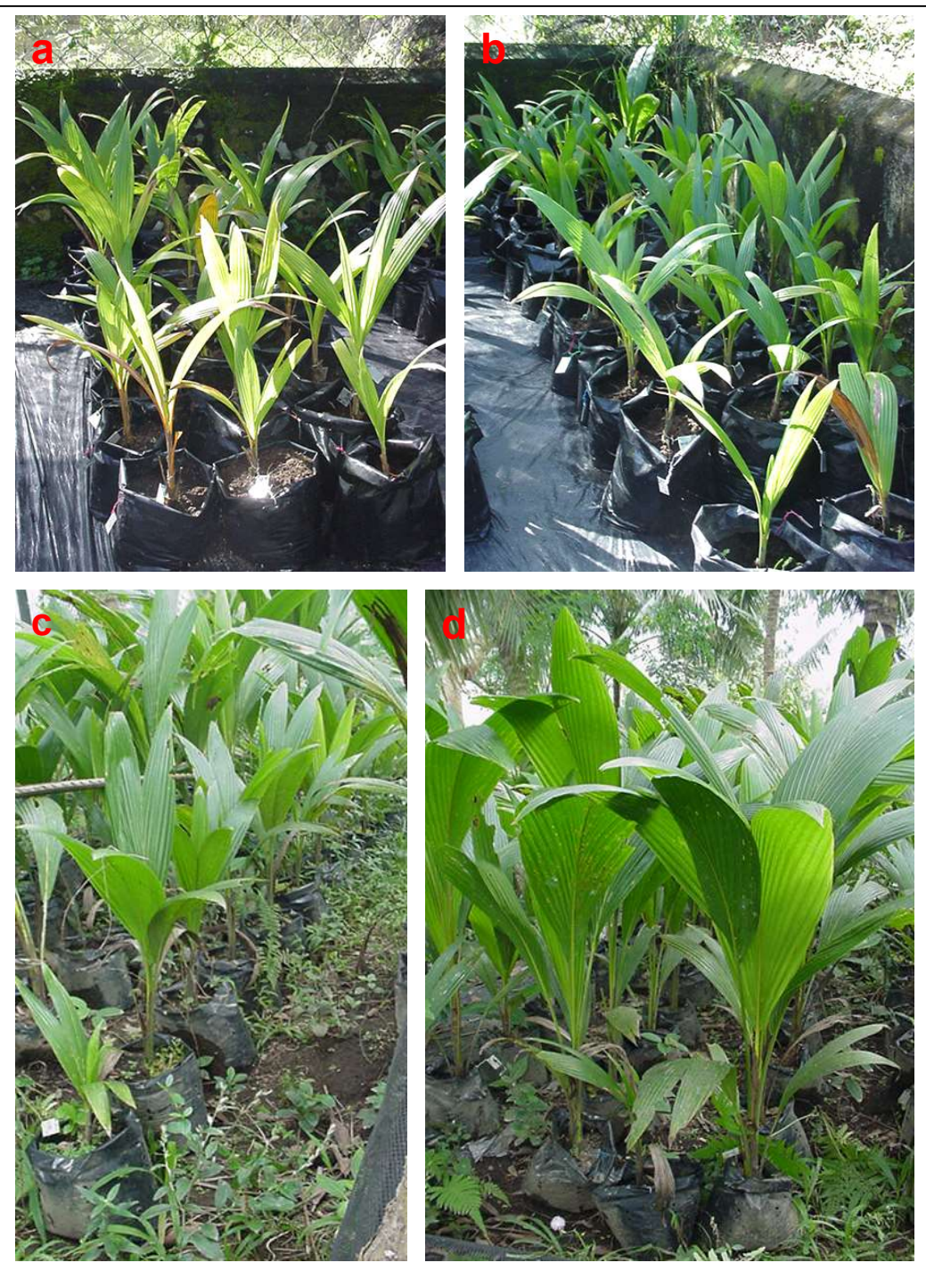
Fig. 3. Embryo cultured Makapuno seedlings (ECMAKT) from the unfertilized plots (FT0) and those treated with sodium chloride and dried chicken manure at moderate rates (total) of 18 g/seedling and 250 g/seedling (FT1) after 6 months (a & b, respectively) and 12 months (c & d, respectively). Note the yellowish-green color of leaves from unfertilized seedlings compared to dark green leaves from fertilized seedlings after 6 months.