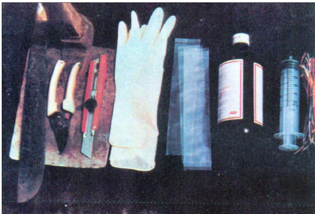
Figure 3. Materials needed for the root absorption technique. From left to right: Hoe, jungle knife, pruning seissor, cutting knife, surgical gloves, plastic bags, a bottle of insecticides, 40 cc plastic syringe and 8 cm long softwires.