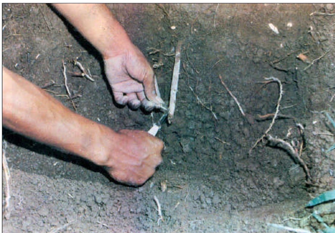
Figure 1. Cutting the root