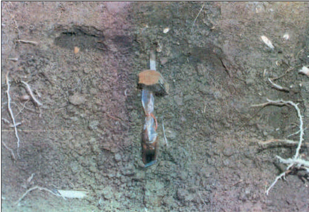
Figure 2. Bending the root with a forked - stick