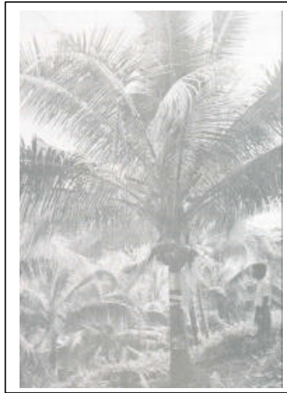
Fig. 1. An eight year old macapuno-bearing D x T hybrid showing typical Morphological characteristics

Each newly opened inflorescence was observed for the duration of its male and female phase and the period of their overlapping. Intrapadix overlapping was expressed as the percentage of the female phase of an inflorescence which was covered by its male phase.