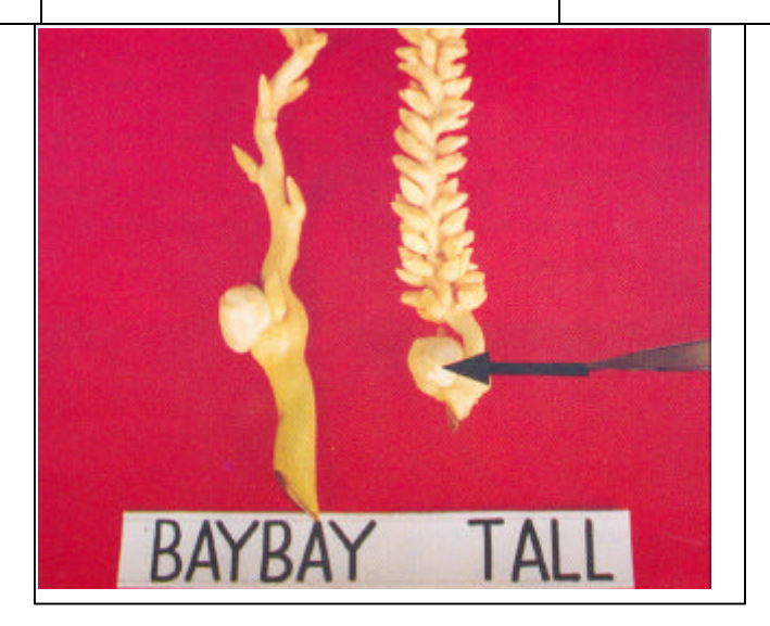
Fig. 2b Exposed anther of a hermaphrodite flower