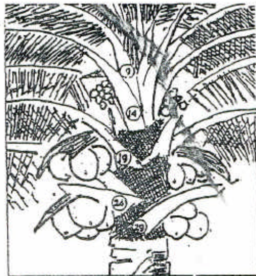
1.2 LEAF PRUNING FROM LEAF #24