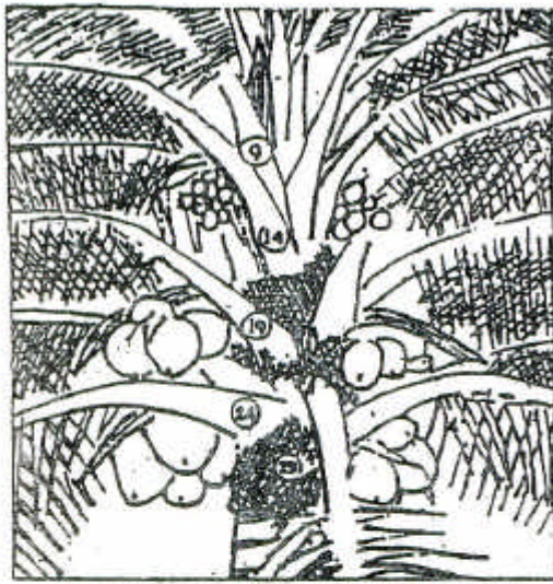
1.1 CONTROL (NO LEAF PRUNING)