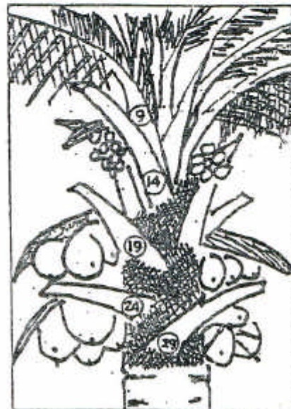
1.4 LEAF PRUNING FROM LEAF #14