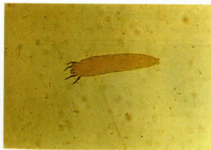
Plate 1: Photomicrograph of eriophyid mite (Full view)

Coconut mite, Aceria guerreronis , Keifer, which made its first appearance as pest in Mexico in 1965 as reported by Keifer, has spread far and wide. Now that 37 years have passed. Research efforts have been made on various aspects of this pest like, origin, occurrence, dispersal, symptoms, population dynamics, management practices like chemical control, bio control, cultural practices, varietal resistance/ tolerances, natural enemies, phytosanitary efforts etc. Two international seminars/ workshops have been held. Many group discussions, steering committee meetings, etc. were also held. Lots of publications have come. An earnest attempt has been made to collect the available literature on this pest which can benefit the member countries and others to know what has been done and what directions one has to move for future research and development. However, this bibliography is not the completed one. There may be many more and we will update as and when we get access to those references. We are confident that this bibliography will help to avoid duplication and take up need based research and development on Eriophyid mite.