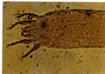
Plate 1a: Magnified view of mouth parts and appendages