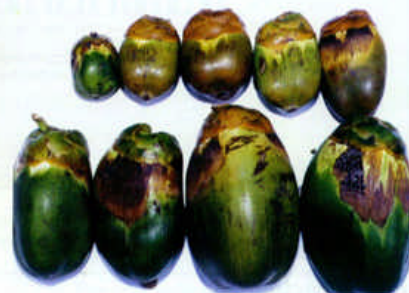
Plate 3: Development of symptoms in young nuts