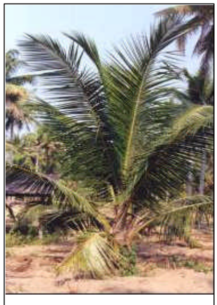
Fig. 8. Same palm after 18 months of boron application