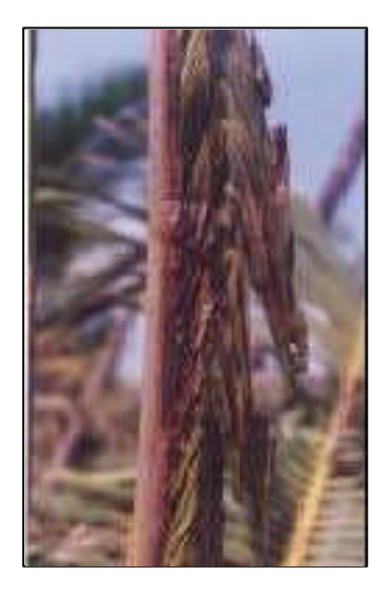
Fig. 2. Hooking of leaves