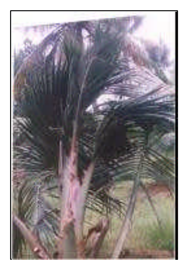
Fig. 3. Reduction of leaf size