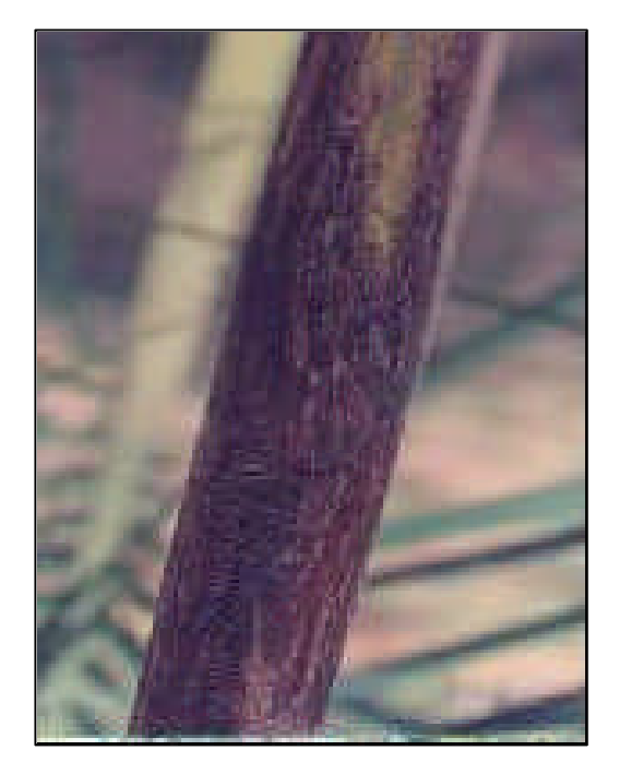
Fig. 4. Cracking in the petiole