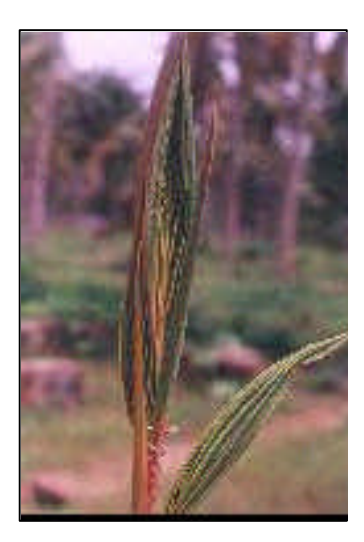
Fig. 1. Fasciation of leaves