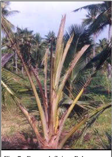
Fig. 7. Boron deficient Palm