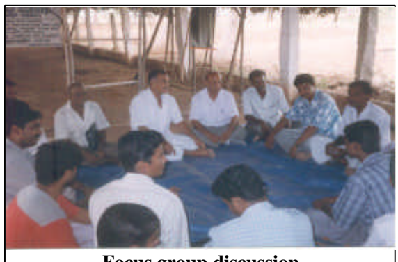
Focus group discussion

Steps were initiated for institutionalization of the associationship of members of core audience by getting them registered under the Tamilnadu Societies Registration Act 1975. Such registered groups are called the Self Help Societies. The leaders of each