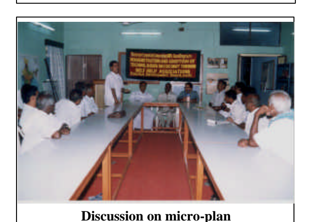
comprehensive detailed micro plan from the

individual plans of their members for an orderly execution and monitoring among the fellow members. They were motivated to guide, counsel and review the performance of each member with respect to adoption of technologies by holding frequent review meetings and focus group discussions. Eventually (it was observed) they were able to find the right type of actions and solutions for a few common problems through their self help society.