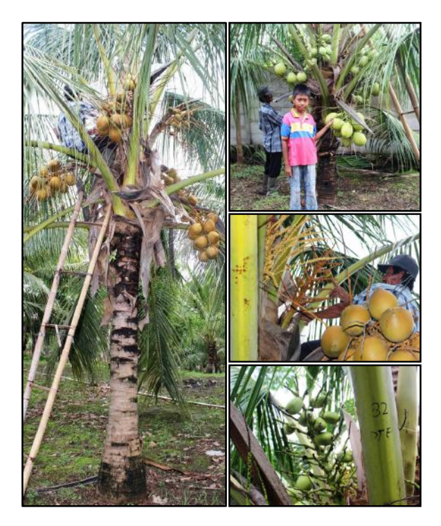
Figure 3. Materials used in research phase III. Female parents used - (A) Homozygote kk Kopyor Tall Coconut and (B) Homozygote kk Kopyor Dwarf Coconut. Counting pollination successes: (C) Homozygote kk Kopyor Tall Coconut x Salak Green Dwarf (SGD) and (D) Homozygote kk Kopyor Dwarf Coconut x Takome Tall (TET)

Introducing kopyor character into different genetic background of coconut will broader the existing genetic variabilities of the existing kopyor varieties. Hybridization among a heterozygote Kk or a homozygote kk kopyor coconut varieties as the kopyor character donor with a number of elite normal coconut varieties should serve the purpose. Heterozygote KkKopyor Yellow Dwarf and Kopyor Green Dwarf were used as kopyor donor. In addition, homozygote kk Kopyor Bakauheni Tall were also used as the other kopyor donor (Figure 3).